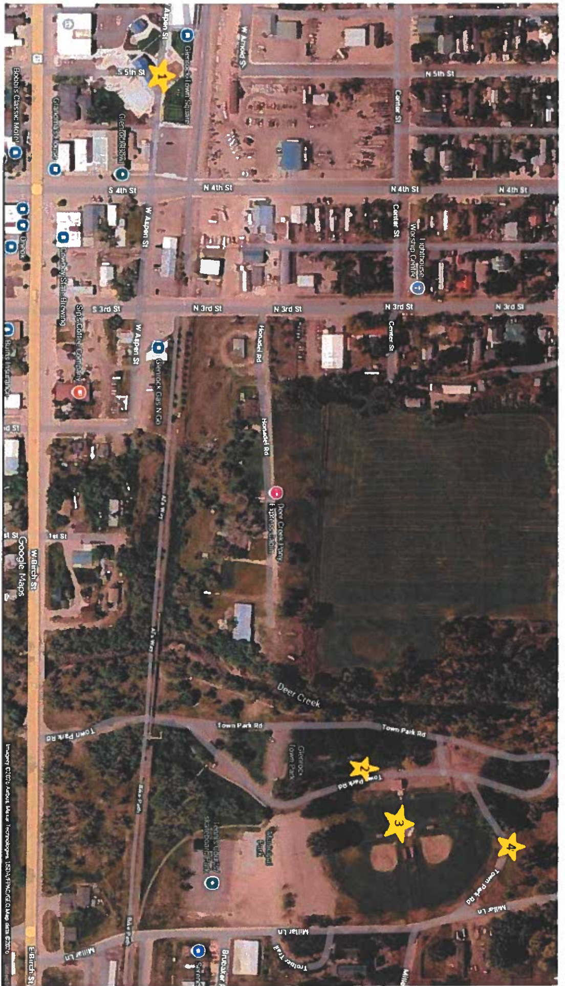
Beer Tent Locations: 1. 6/27 Glenrock Town Square 2. 6/27 & 6/28 Town Park Vendor Booth Area 3. 6/27 Glenrock Games Area 4. 6/28 Mud Volleyball Area